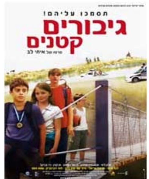
Little Heroes movie poster